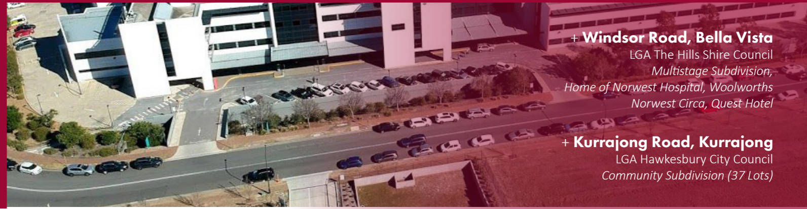
+ Windsor Road, Bella Vista LGA The Hills Shire Council Multistage Subdivision, Home of Norwest Hospital, Woolworths Norwest Circa, Quest Hotel

The majority of our projects comprise of our full range of land development consultancy services including: surveying, project management, civil engineering, supervision of engineering works, water servicing coordination.